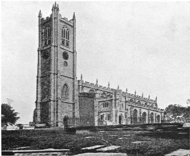
THE PARISH CHURCH, LANCASTER.